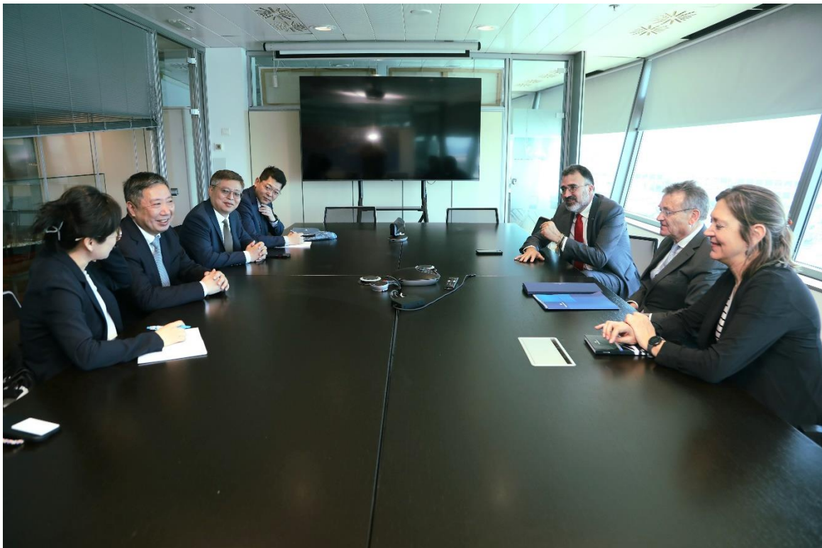
Photo 2. The working meeting held by both delegations.