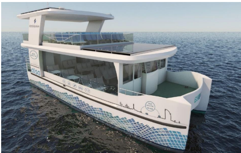
PHOTO: Rendering of one of the vessels that will provide the nautical bus service.

The item approved today by the Management Board is an important step in developing the Port of Barcelona's Energy Transition Plan. The future zero-emission fuel plant is expected to generate new maritime traffic with cleaner fleets of ships and facilitate the use of such new fuels in other port and logistics activities in the port and the surrounding area.