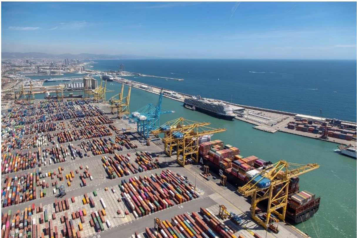
PHOTO: Aerial image of the Port of Barcelona.